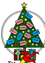
THE GIVING TREE

There will be donation envelopes on the pews and a leaving collection held after all Masses. Donation envelopes can be placed in the second collection during masses or in the poor boxes in the foyer.